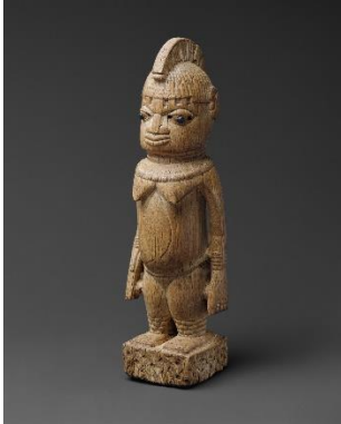
Female Figure // Weibliche Figur , Object No.: 1978.412.302.

Metropolitan Museum of Art, New York, USA