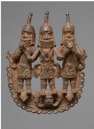
Pendant with the royal triad // Anhänger mit Königreicher Triade ,

https://digitalbenin.org/catalogue/22_19911777