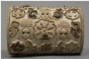
Arm cuff // Armspange , Inv. No. LG1948.28.1

https://digitalbenin.org/catalogue/37_LG1954157