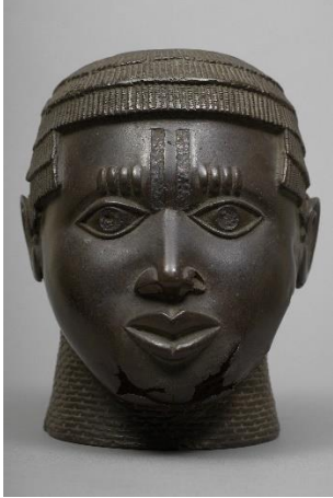
Trophy head // Trophäenkopf , Inv. No. LG 1954.15.7