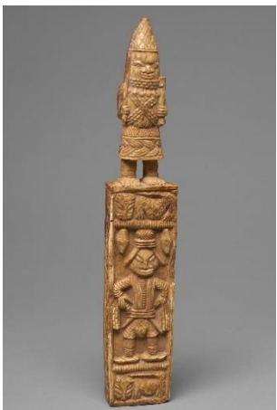
Door bolt // Türbolzen , Inv. No. 64781

https://digitalbenin.org/catalogue/50_VO98161